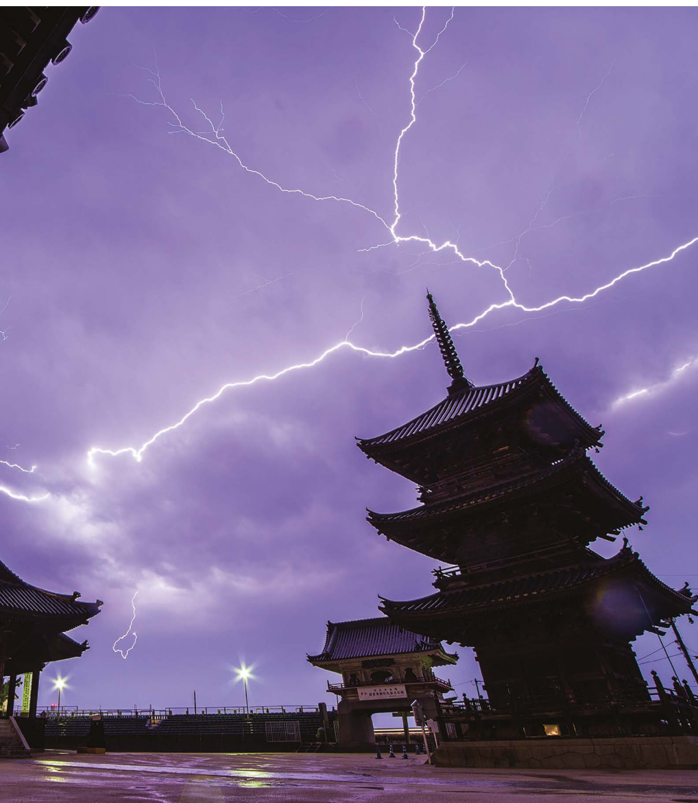
Thunderstorms in parts of Japan are known for producing \gamma -ray flashes and glows.